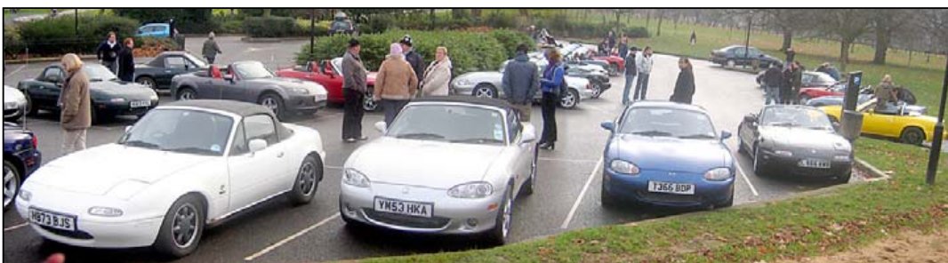
■ A selection of the 30 roadsters and their respective owners gather in Hyde Park before the start of this year's central London drive.